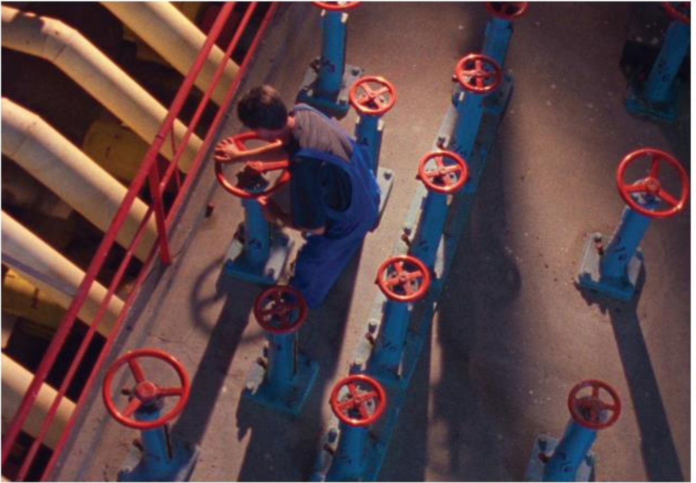
Still from Ericka Beckman's Switch Center (2003)

At the core of her oeuvre is a feminist brand of Marxist critique. Take, for instance, Cinderella (1986)—the second-oldest film included in MIT's survey—which places the fairy tale heroine, played by the artist, within an ambiguous and shadowy gaming landscape with no horizon. The work is littered with bright, Tetris-like block formations that continually break apart as she moves through them, grasping for something to hold on to.