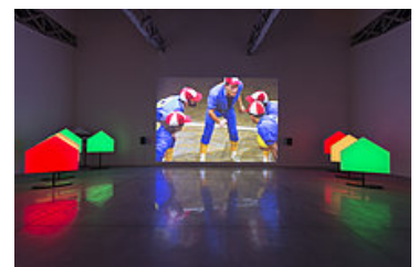
Ericka Beckman, You The Better , Film Installation, 1983/2015

Black-and-white photographs 13 x 15-3/4 in. each of five Collection Walker Art Center, Minneapolis, Justin Smith Purchase Fund and T. B. Walker Acquisition Fund, 2015