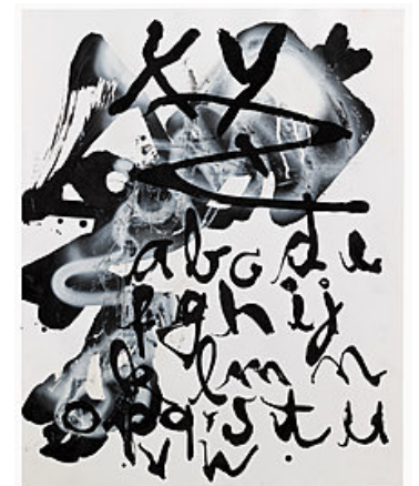
Charline von Heyl , Folk Tales , 2013

Ink and typewriter text on paper 11 x 8.5 inches Collection Walker Art Center, T. B. Walker Acquisition Fund and the Miriam and Erwin Kelen Acquisition Fund for Drawings, 2015