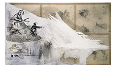
Sigmar Polke, Frau Herbst und ihre zwei Töchter (Mrs. Autumn and Her Two Daughters) , 1991