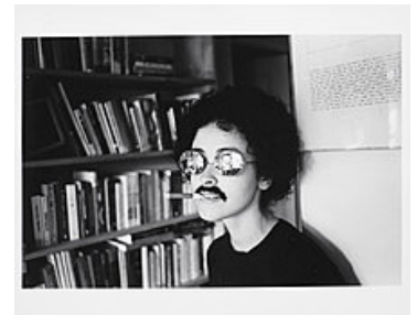
Adrian Piper, The Mythic Being: Sol's Drawing #1-5 , 1974

Three-channel digital video projection (color, silent), 5h 45' Installation view, Greene Naftali, 2009